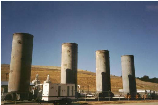
ENCLOSED LANDFILL FLARES

CONTROL PANEL — The FEF control panel can be supplied in either a NEMA 4X or NEMA 7 enclosure. Temperature controls, safety systems, remote start / stop, and alarm contacts are standard items. A completely automated system is the design basis for our controls system.