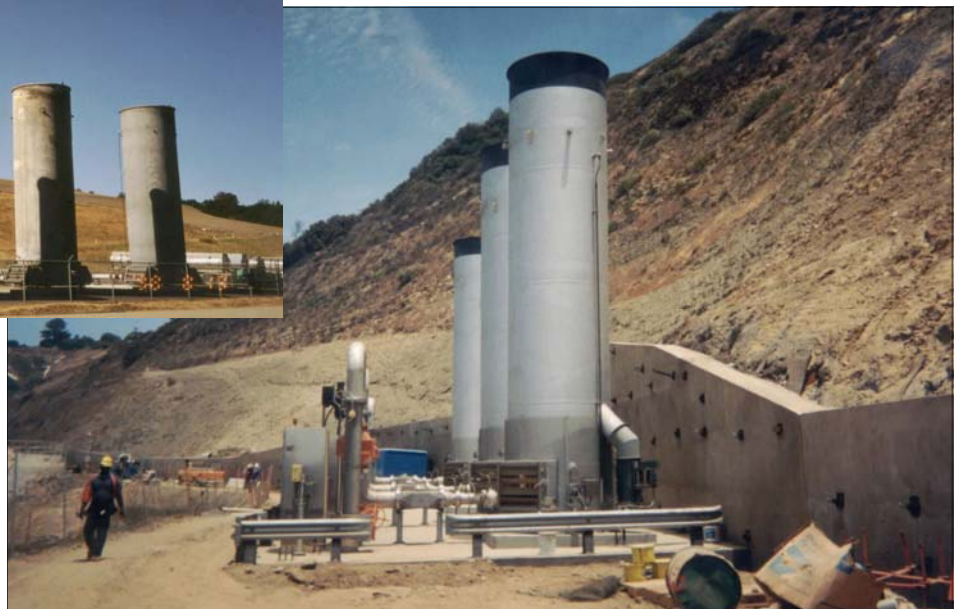
ENCLOSED BIO-GAS FLARES